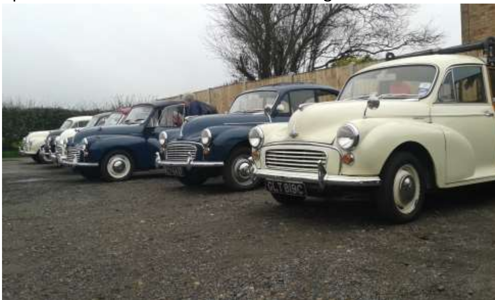
The start of the drive out, meeting at The Huntsman PH

The Drive out to Malvern went well with 8 cars braving the wind and rain. We meet at the Huntsman PH at 12 then drove in a convoy first to Upton on Severn, then to the Bluebell PH just on the Edge of Malvern. Chris had booked some tables for us, and we had a good meal followed by a chat inside a nice warm pub while we watched the rain streaming down the windows.