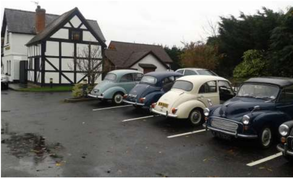
The Minors at the Bluebell PH