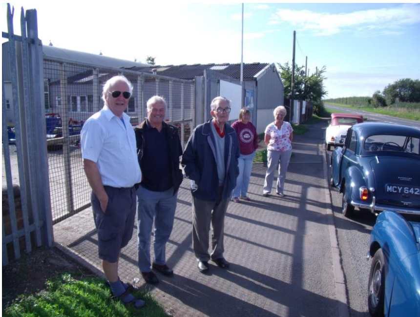
Members at Ryall before setting off to Tewkesbury.

Our annual visit to Tewkesbury show was very successful. The weather was thankfully fine after the outlook had looked very uncertain earlier in the week. Seven Morris Minors and owners met up at Ryall before setting off for the show. As I led the convoy it was a good move that I had brought the 948! One problem that we experienced again this year was the ability to be able to all park together. This seemed more acute than ever this time. Next year I am going to see if we can park at the bottom of the field in an effort to overcome this. There was a vast selection of cars again on display and many Morris Minors. I spent some time talking to a Morris Minor owner who had only recently purchased a 1959 Minor that was only 1 month difference in age to mine. It was a beautiful car and had only done 15,000 miles. There were, as usual, a wide variety of stalls to visit around the perimeter. Just before 3.00pm the mass exodus began. Wisely, members hung on until the bulk of the cars had departed before making a move. The Tewkesbury show makes for a very pleasant day out and there is always something new to catch the eye.